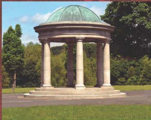
Islandbridge Memorial Gardens Domed Temple