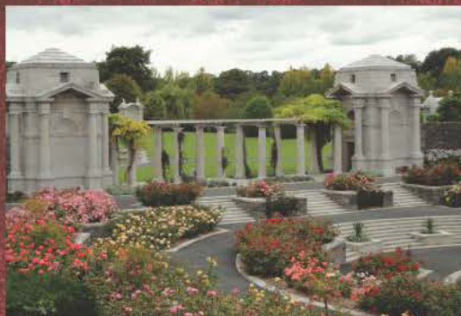
Islandbridge Memorial Gardens - sunken garden, pavilion & pergola

Sir Edwin Lutyens's famous tranquil garden on the banks of the Liffey was built in 1930s to commemorate more the 49,000 Irishmen who died during the Great War. At the garden centre lies the Great War Memorial Stone, surrounded by circular fountains which in turn are enclosed by pairs of pavilions (the 'book rooms'), pergolas and sunken rose gardens. Restored by OPW and the Trustees of the Irish National War Memorial gardens from 1985-93.