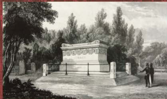
Curran's Tomb, Glasnevin